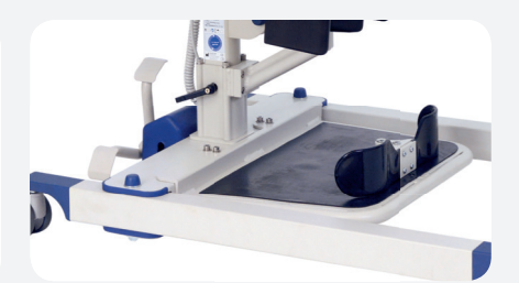
Safe stand due to the rubberized foot plate with removable, rubberized heel stop.