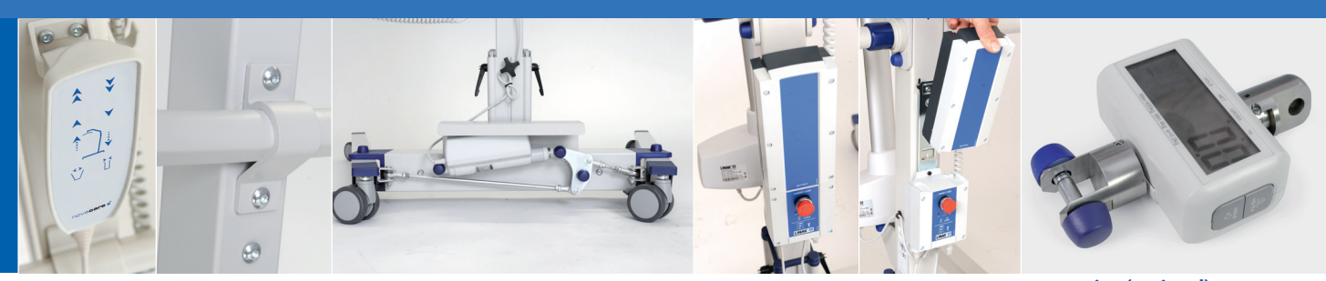
A Manual control with two speed variations.