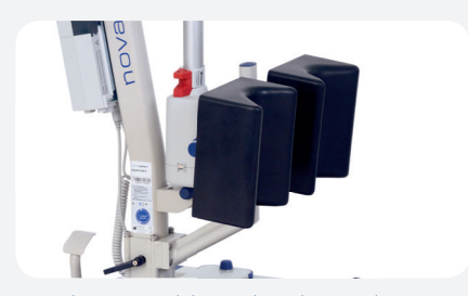
Due to their anatomical shape and complex integral foam construction, the shin pads ensure minimum pressure on the shin.