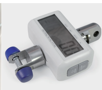
Accessories (optional): The patient scale is a class 3 scale with a max. patient weight of 400 kg.