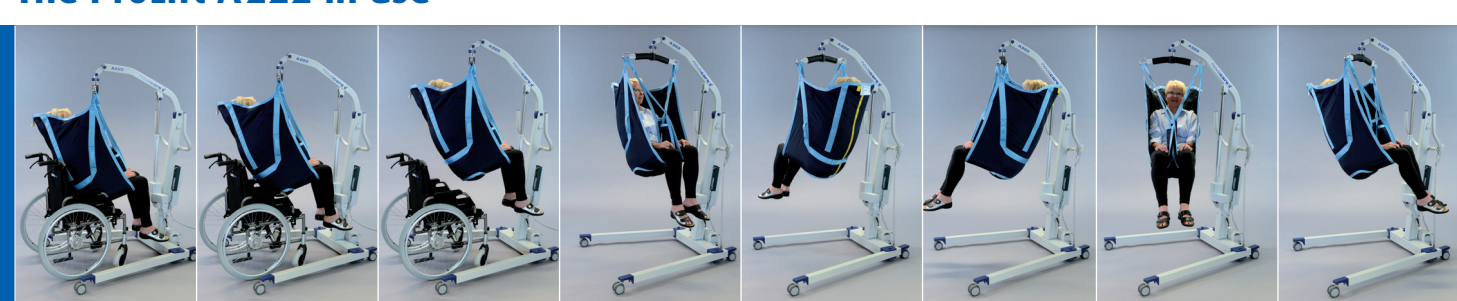
The ProLift A222 in use with the Highsupport. Further slings see page 11.