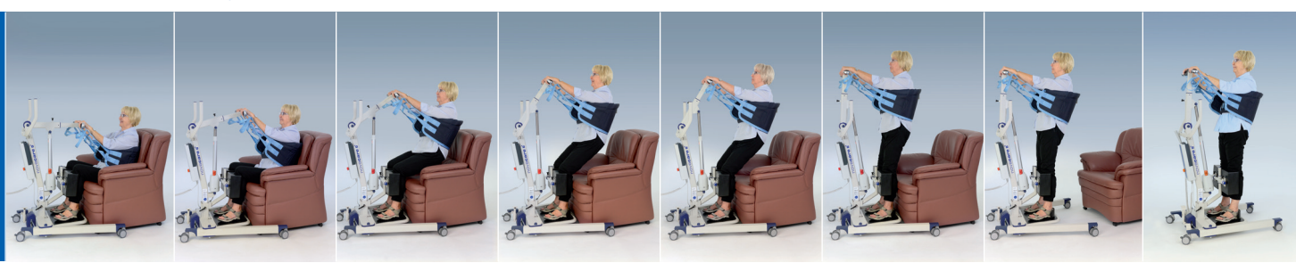
The ProLift Argo in use with the Standsupport. Further slings see page 11.